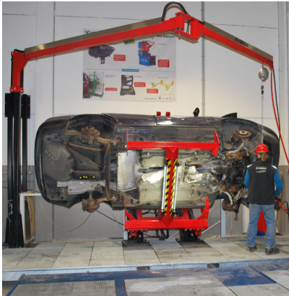
(Optional) integrated swingarm improves dismantling time