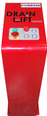
Clear and easy-to-use control panel