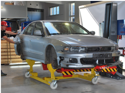
Forklift free loading with trolley