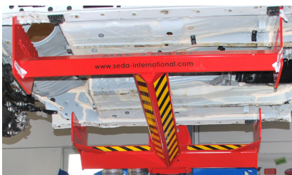
Easy access to vehicles un- derside due to H-design of the carriage