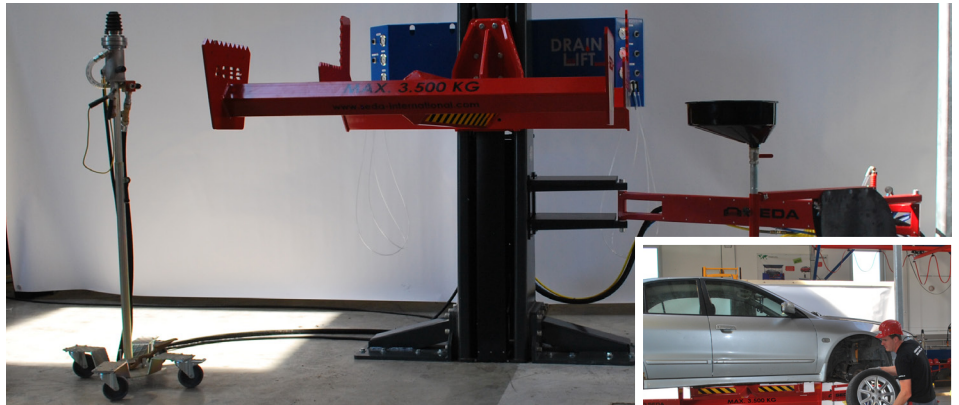
Drainage with mobile Tank Drilling Machine