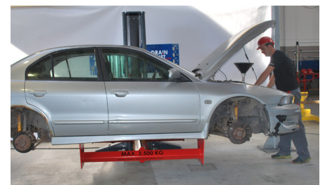
Easy engine access