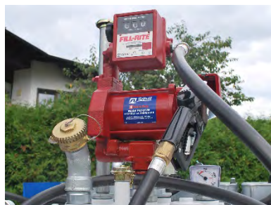
Pump, counter and nozzle