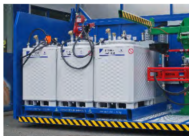
Well-integrated in MDS6 Container for transport